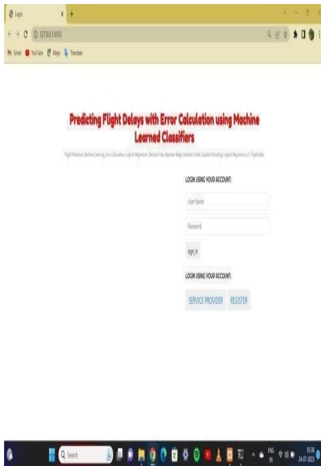
Fig-2: Home Page