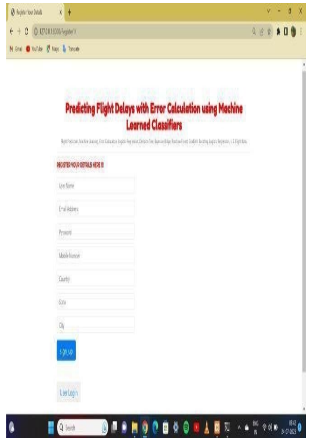
Fig. 3: View All Flight Details